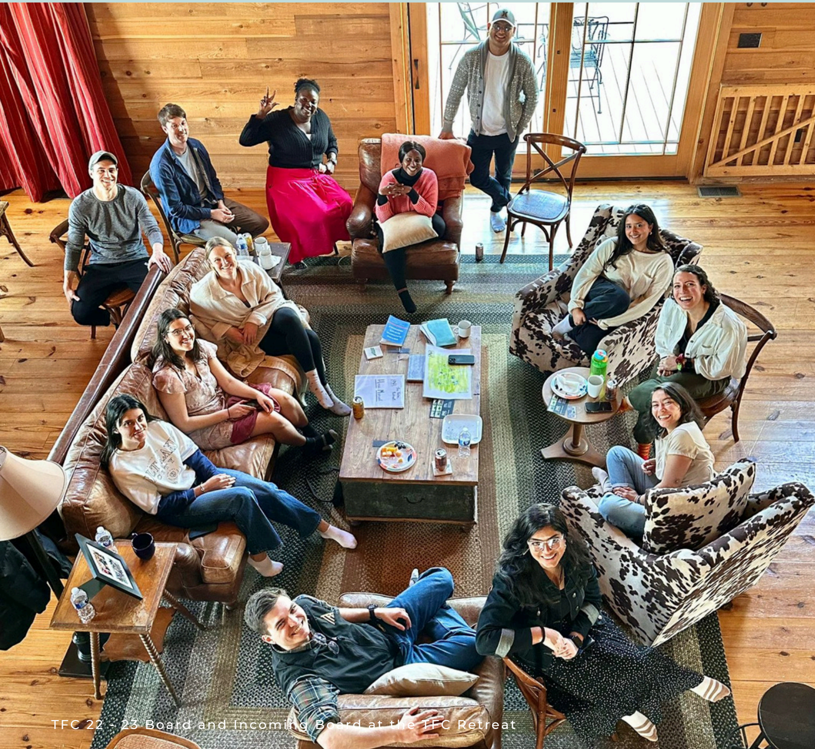
TFC 22 - 23 Board and Incoming Board at the TFC Retreat