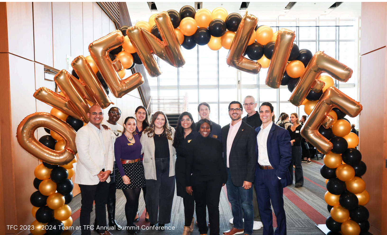
TFC 2023 – 2024 Team at TFC Annual Summit Conference