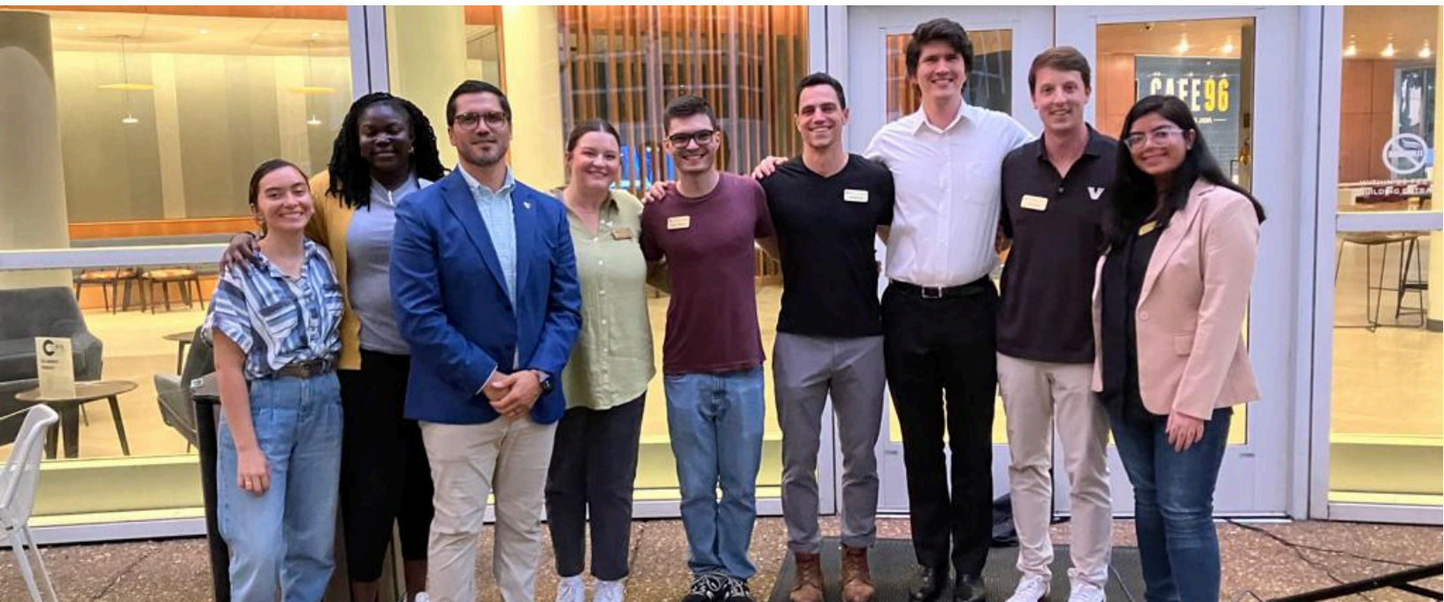
TFC Board & Staff 2023 – 2024