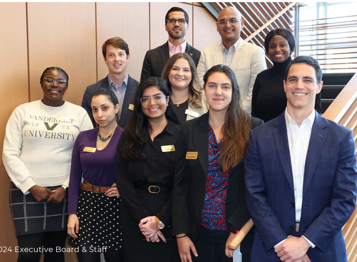
TFC 2023 - 2024 Executive Board & Staff