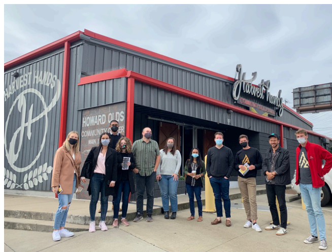
Visits to Harvest Hands and Trevecca Urban Farm