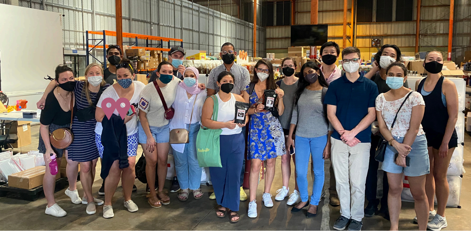
Visit to Brands of Puerto Rico