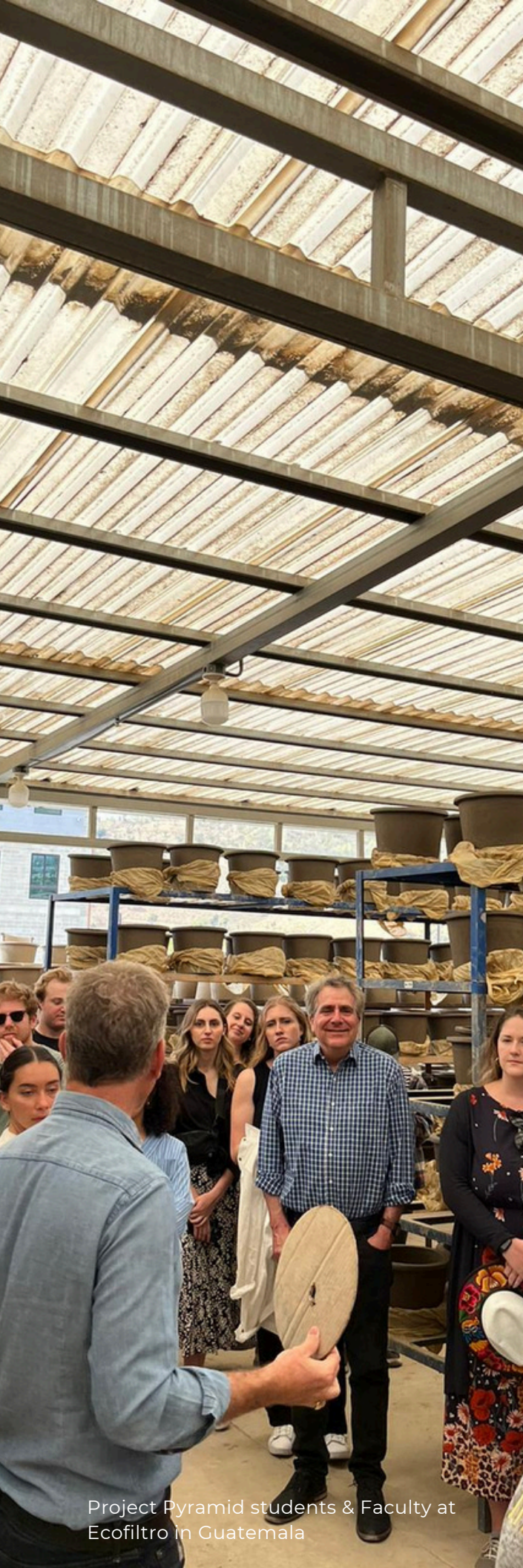
Project Pyramid students & Faculty at Ecofiltro in Guatemala